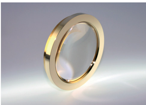
Adhesive-free and low-stress laser soldered lens with alignment turned mount.

Fraunhofer IOF Albert-Einstein-Strasse 7 07745 Jena Germany www.iof.fraunhofer.de